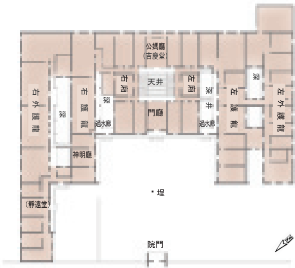
梅鶴山莊平面圖 The plan of Meihe House

The direction and layout of Meihe House was decided in accordance with fengshuei of Luantou School with Touliao Hill at its back, Caoling Hill on its right, a vegetable farm and a pond in the front, and Sinfu Ditch nearby. Facing northwest, the house is surrounded by a bamboo forest with an entrance structure having a raised-ridge in the front and a stone fence with a cobble base.