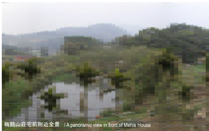
梅鶴山莊宅前附近全景 / A panoramic view in front of Mehie House

目前來台林家已・經8代（汝字輩），前大溪鎮鎮長林煥達（第5代）及現任桃園縣縣長朱立倫的母親均出自此宅，現仍有11・後代子孫住在梅鶴山莊・。