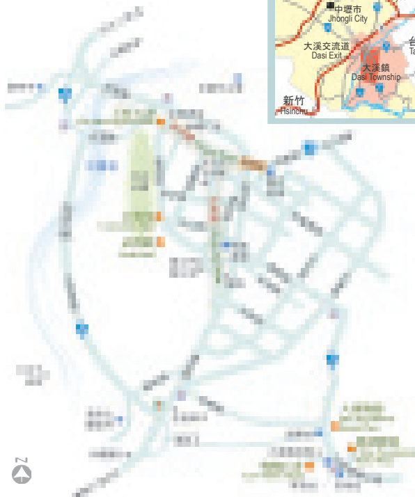
圖例 Map Legend

▲ 史建築 Historic Site ▲ 古蹟 Ancient Monument ▲ 重要史蹟 Historic Relic 車站 Station