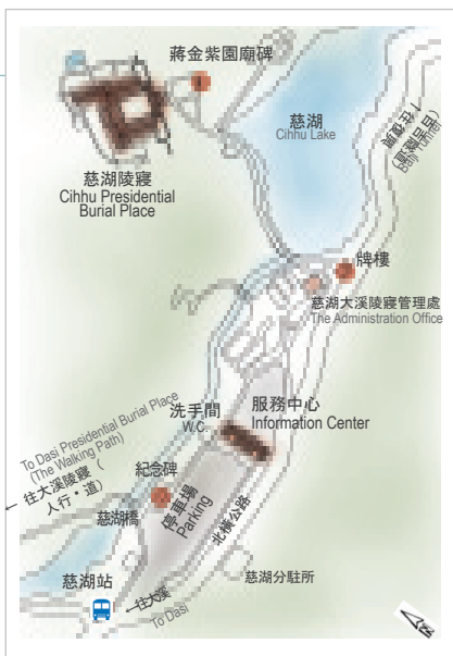
慈湖陵寢配置圖 Site Plan of Cihhu Presidential Burial Place